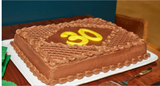
QUAFF celebrated 30 years at AleSmith.